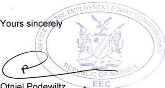
Otniel Podewiltz EMPLOYMENT EQUITY COMMISSIONER